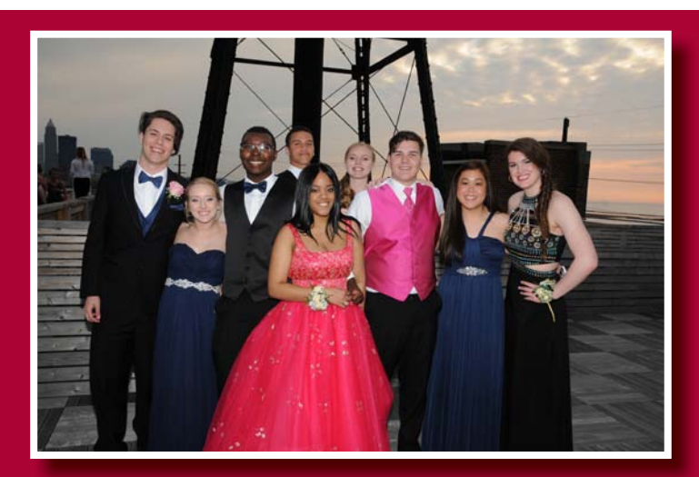
Senior Prom Students enjoyed views of the Cleveland skyline from the rooftop of the Ariel International Center, the venue for this year's prom.