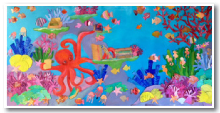
Strength in Numbers

Every year, the fourth grade class at Kensington Intermediate School works cooperatively on an art project. The project gives the students a chance to create an individual piece as well as a group piece. The group project is displayed at the District Art Show and then added to Kensington's permanent collection, where it will hang in the office.