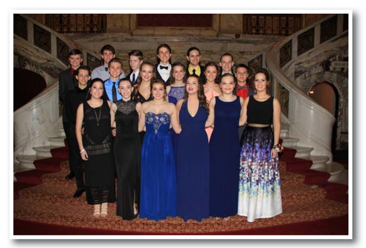
Members of the RRHS Drama Department attend the 2016 Dazzle Awards at Playhouse Square.

The RRHS Drama Department's production of Catch Me If You Can was the winner of the 2016 Dazzle Awards The Connor Family Best Musical.